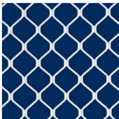
Grille Design 127