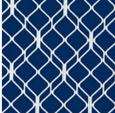
Grille Design 122

SecuraMesh® security grilles are available in a variety of styles and powdercoat colours to suit your home décor requirements.