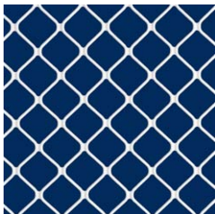
Grille Design 125