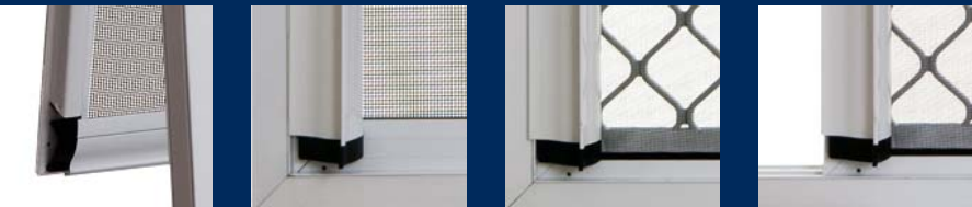
Spring loaded release handle allowing rapid operation in urgent situations