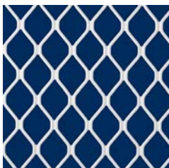
Grille Design 133